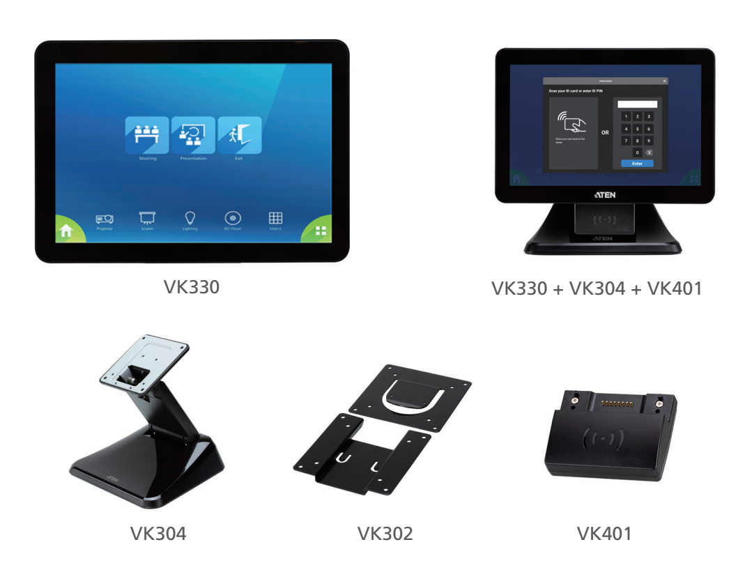
The Touch Panel VK330, the Tabletop Kit VK304, the Wall Mount Kit VK302, and the Access Inspector VK401 are sold separately.

The ATEN Control System is a standard Ethernet-based management system consisting of controllers, expansion boxes, configurator, and control interfaces that connects all hardware devices to provide centralized control of devices directly and effortlessly from any mobile device or ATEN Control System interface. Now we have the VK330 touch panel join the ATEN Control System family to make our control system solution complete and that meets the demanding requirements for the target applications.